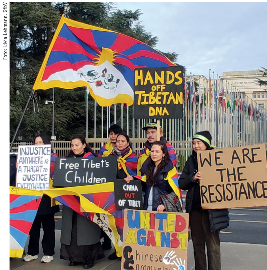
Tibetans in exile demonstrate on the Place des Nations in Geneva.

The STP has increased the number of staff working on its programme 'No Complicity: Human Rights in China'. It works closely with the Uyghur and Tibetan communities in Switzerland, and is calling on Switzerland to make its stance clear to China and to conduct its business activities responsibly.