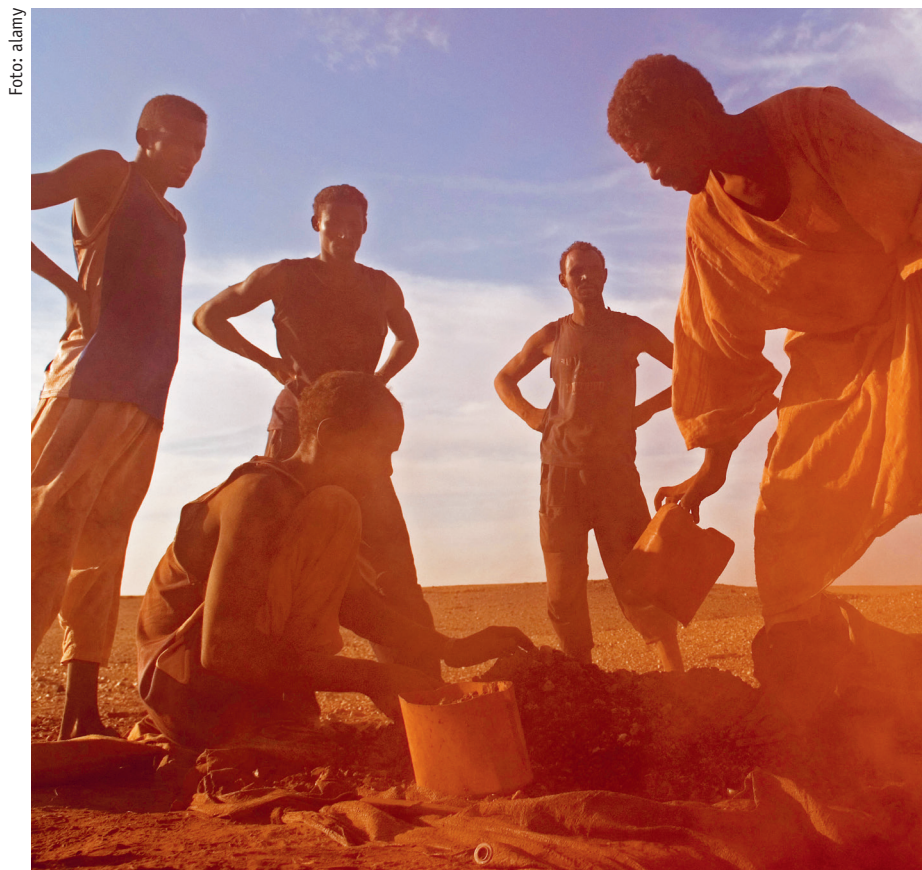
Gold mining in Sudan: the paramilitary group RSF uses the raw material to finance itself during the war.

After around ten years, a key moment arrived concerning the gold programme, when the Federal Supreme Court ruled in favour of the refineries and decided that the STP will not be given insight into Swiss refineries' business relations, indicating that it is against transparency in the gold industry. The Federal Supreme Court is thus continuing to protect the import of dirty gold. However, the problem has been publicised.